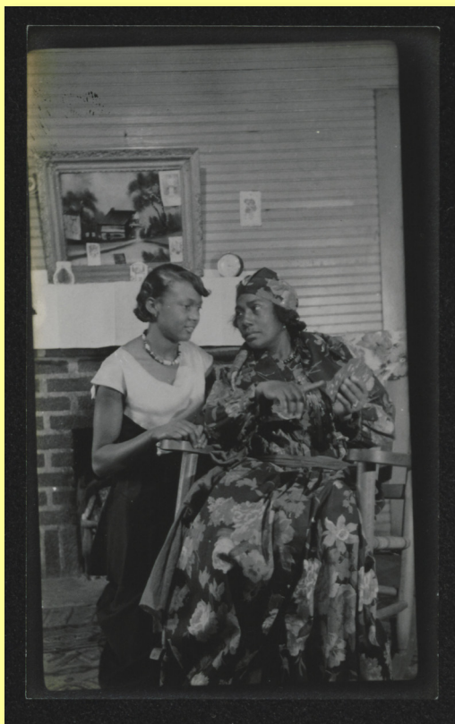
Photograph of a woman seated with her daughter. [ca. 1936 - 1942]