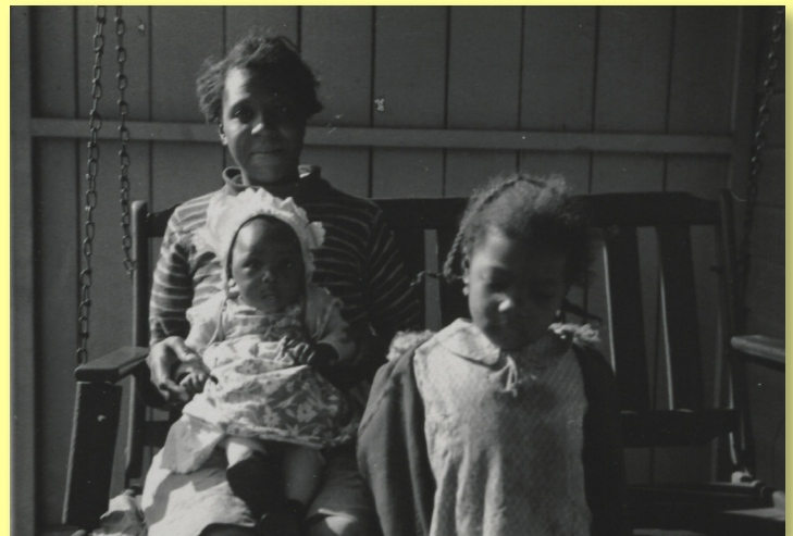
Photograph of a woman seated on a porch swing with children. [ca. 1936 - 1942]