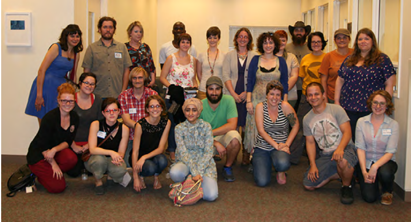
Artists in the 2013 Joyner Library Graduate Student Art and Design Exhibition