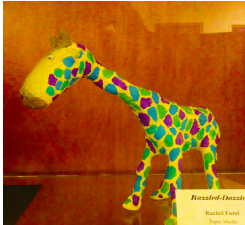
A paper maché giraffe on display in the TRC.

This year we have 26 pieces of art from 14 different schools in Pitt County. The pieces were selected from the Greenville Museum of Art's K-12 show that was held over the summer. Covering a wide range of media from ceramic, to acrylic paint, to recycled materials, the art provides an example of the immense talent of art students across our county. The TRC is proud to showcase these students' work.