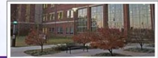
Laupus Library - West Campus