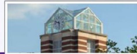
Joyner Library - East Campus

Improve the quality of your students' research skills and information sources by bringing your class to the library for a library instruction session. Studies show that students who attend library instruction sessions demonstrate markedly better research skills than those who do not.