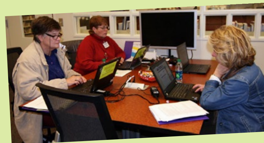
Participants use library technology during Summit workshop.