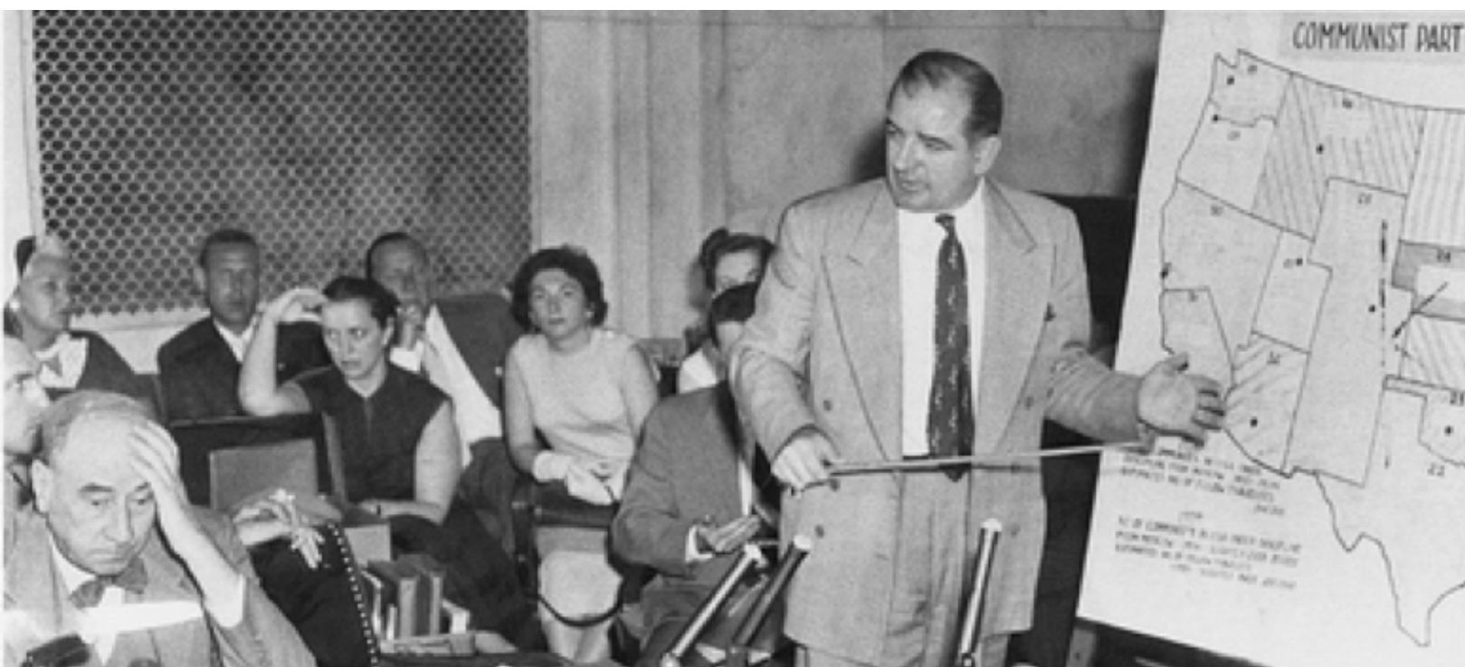
Senator Joseph McCarthy during the famous Army-McCarthy hearings of 1954. Attorney Joseph Welch, who famously asked McCarthy "Have you no sense of decency, sir?", looks chagrined in the left foreground.