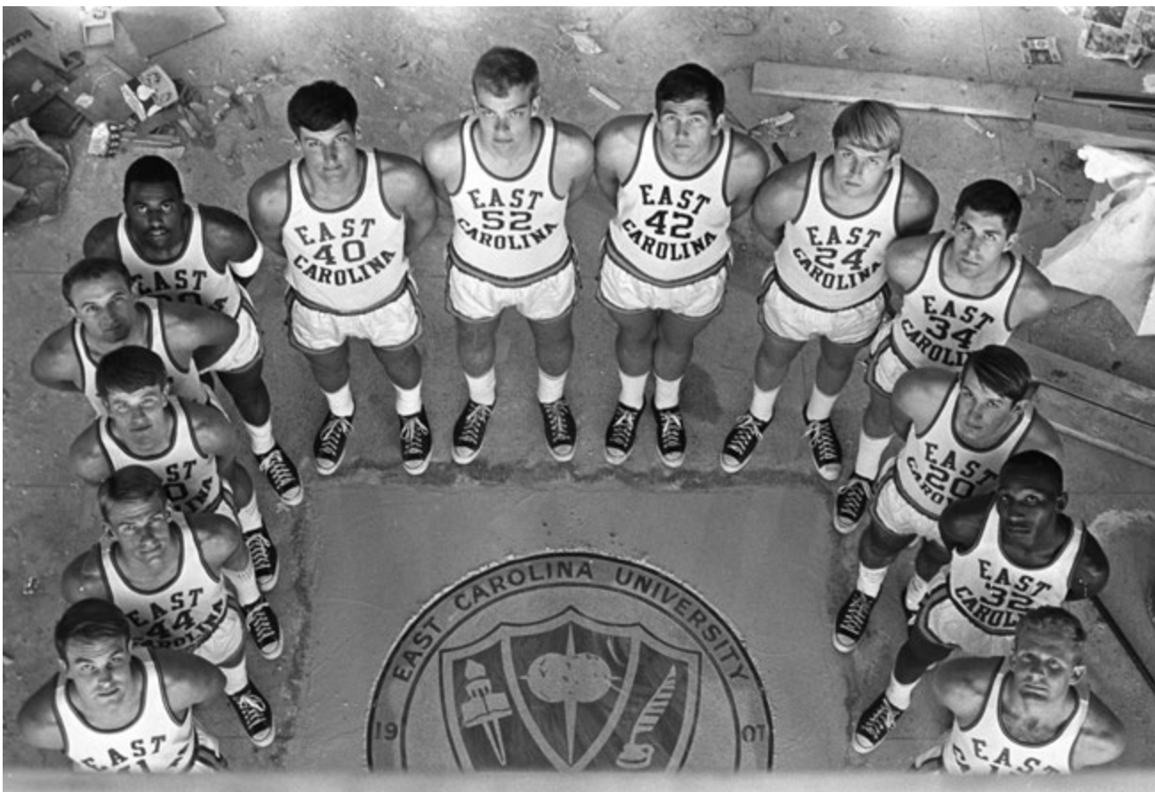
First desegregated basketball team, standing around the East Carolina University emblem, 1967.