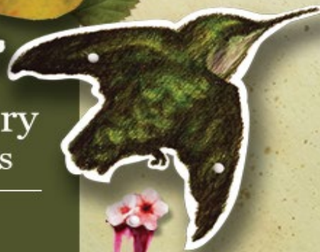
Exhibit Area second floor