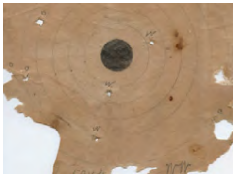
Shooting target used by the Wright Brothers at Kitty Hawk