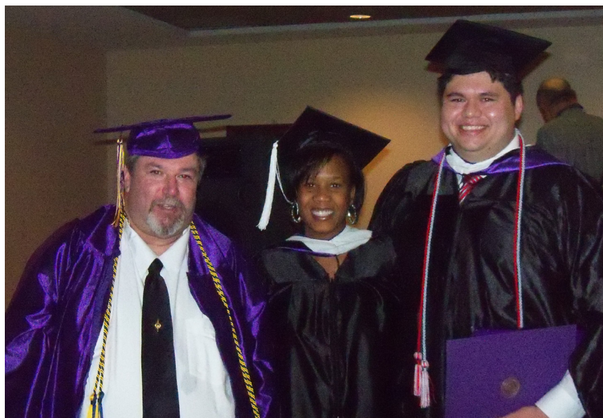
Joyner Library Graduates