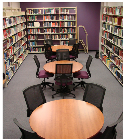
The Music Library

The new Collaborative Learning Center wasn’t the only Joyner public service area to receive a nip-and-tuck during the summer of 2010. The Music Library did as well, and did so in tasteful tones of purple and gold. Two different passionate accent wall colors were applied—a light one in the computer lab and a dark one in the reference area. Rectangular box lamps and a floor lamp with faux gold leaf bases were added to the technology lab, as were plum-colored lounge chairs with gold and light blue accents, study tablets, and under-seat book