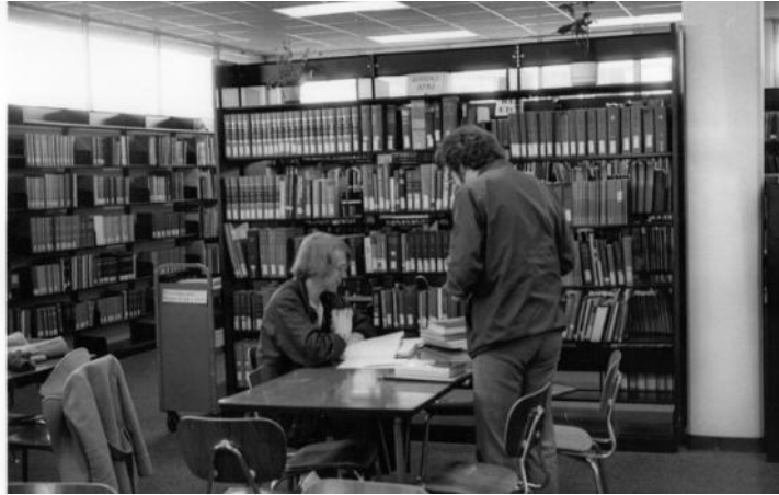
Students at the Music Library.