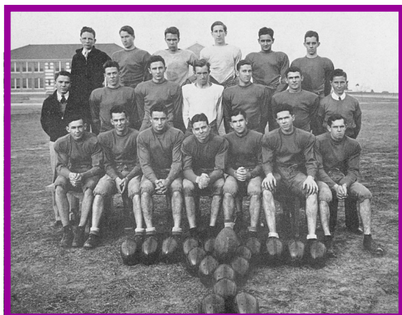
Left East Carolina Teachers College Football Team, 1932. 1932 is the first year ECTC had intercollegiate football.

"For these two centennial books, the University Archives supplied me essential scenes and words from a hundred years of East Carolina's yesterdays. For our tomorrows, the University Archives, I trust, will offer the rest of the story."