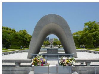
Hiroshima Cenotaph Eternal Flame

materials and have them shipped to the school free of charge. For more information on this exciting community outreach program, visit Educator Card .